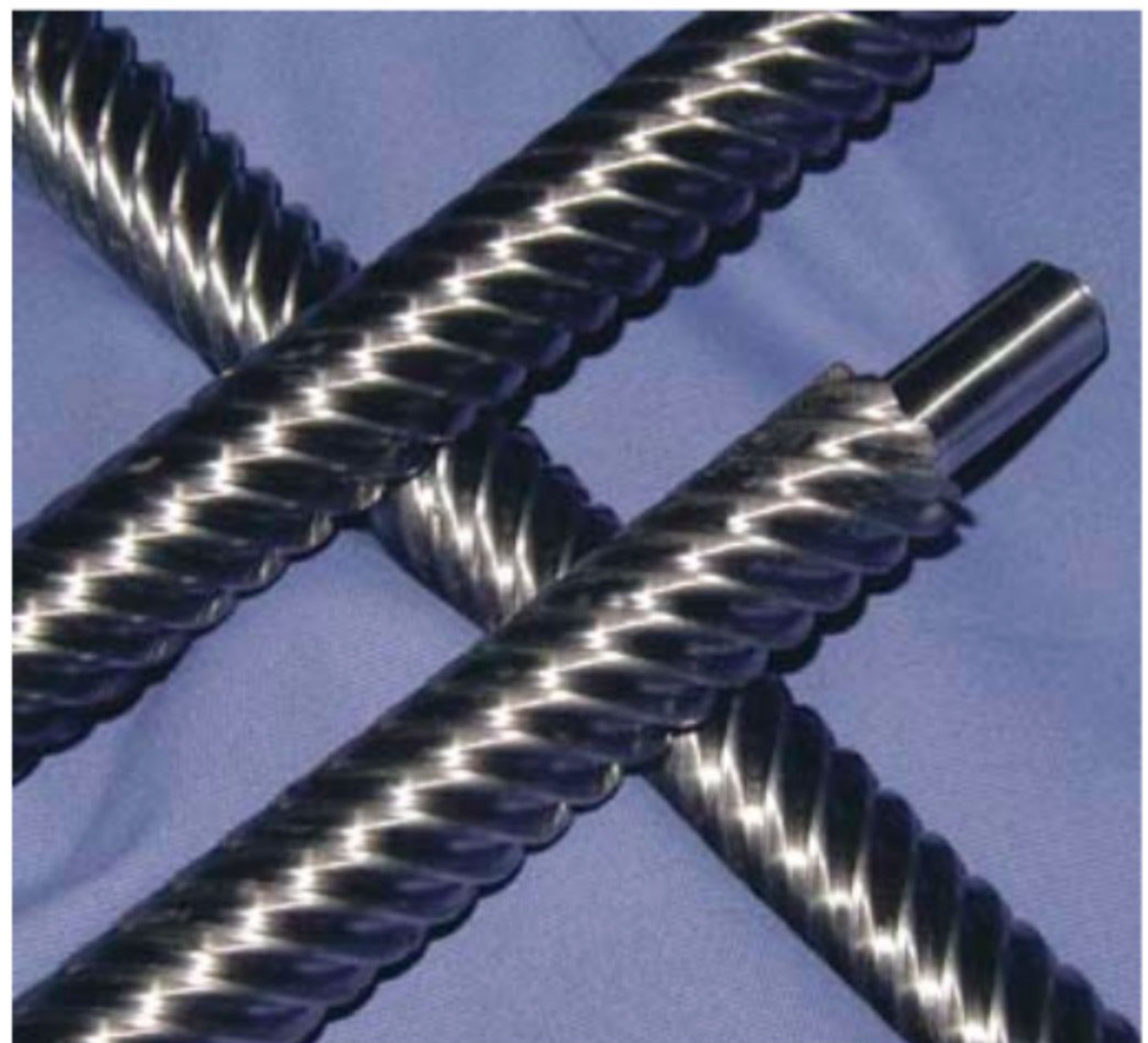
8-head threaded rods